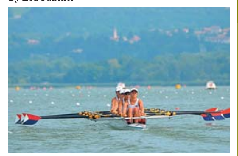
Oakland Strokes rowers at a recent regatta